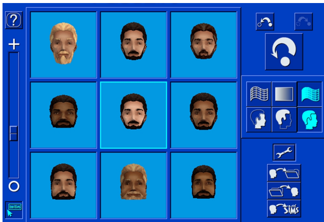
Figure 2. Using a genetic algorithm technique to browse through face space, this early prototype was commissioned by Maxis for their popular game “The Sims”.

This system uses a genetic algorithm technique known as aesthetic selection [4] to search through face space, using approximately 25 parameters to specify the genotype. In this prototype, a menu of random faces is generated from random points in face space. By selecting one of the faces, the user is able to surf through the local region centered around the selected face and can increase or decrease the local region of similarly looking faces by the use of a mutation rate slider and other controls. In this way, novice users can “find” or breed a face or family of related faces that appeal to them for use in the game.