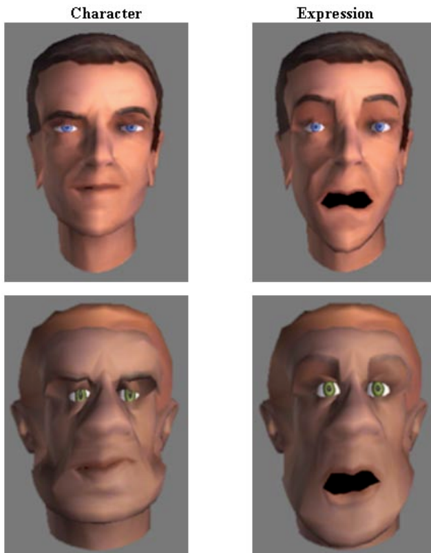
Figure 3. Two characters with the same "fear" expression applied to each. The "fear" behavior creates the impression of fear that is recognizable, but unique to each face. Note how the asymmetries inherent in the bottom character are preserved.